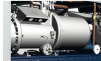
Maximum accessibility to compressors.