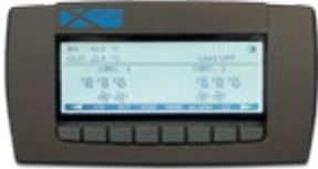
Semigraphic user interface with multifunctional buttons and dynamic display icons.