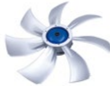
High efficiency EC axial fans with inverter technology.